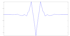
Figure 2 : CDF 5-3 wavelet